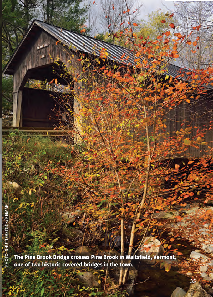
The Pine Brook Bridge crosses Pine Brook in Waitsfield, Vermont, one of two historic covered bridges in the town.