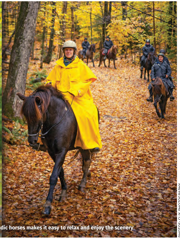
The patient, people-oriented temperament of the Icelandic horses makes it easy to relax and enjoy the scenery.