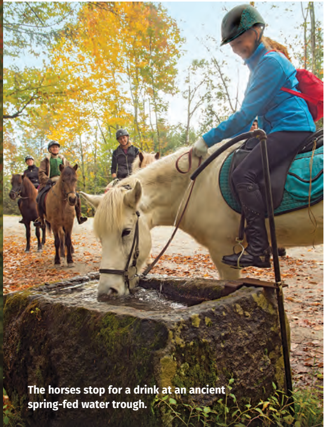
The horses stop for a drink at an ancient spring-fed water trough.