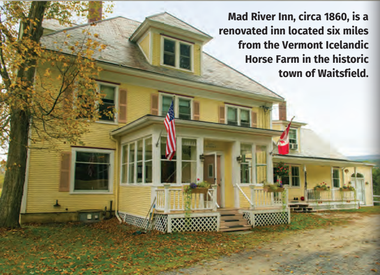
Mad River Inn, circa 1860, is a renovated inn located six miles from the Vermont Icelandic Horse Farm in the historic town of Waitsfield.