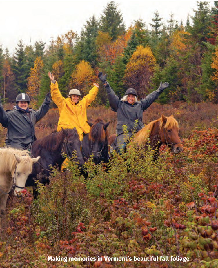
Making memories in Vermont's beautiful fall foliage.

The next morning dawns with a hint of blue in the horizon.