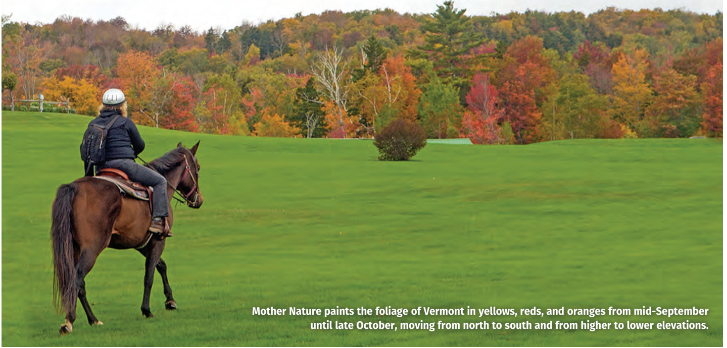
Mother Nature paints the foliage of Vermont in yellows, reds, and oranges from mid-September until late October, moving from north to south and from higher to lower elevations.

number one. Their willingness to tolerate so much, combined with their easygoing personality, makes them a perfect match for any trail enthusiast,” says Winhold.